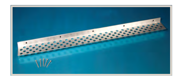
3.25+x36+Length. can be cut easily or can be added to additional units to achieve virtually any length desired.