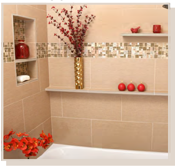
LEDGELINE™ is manufactured in the U.S.A.