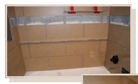
Place the Ledgeline™ directly on top edge of selected tile course. Apply surface bull-nose tile (SBN) or other finish material to top and bottom of Ledgeline™ by using thin-set or mastic to "sandwich" shelf unit. Allow front edge of applied tiles to extend 1/8" minimum to allow for grout coverage of shelf.